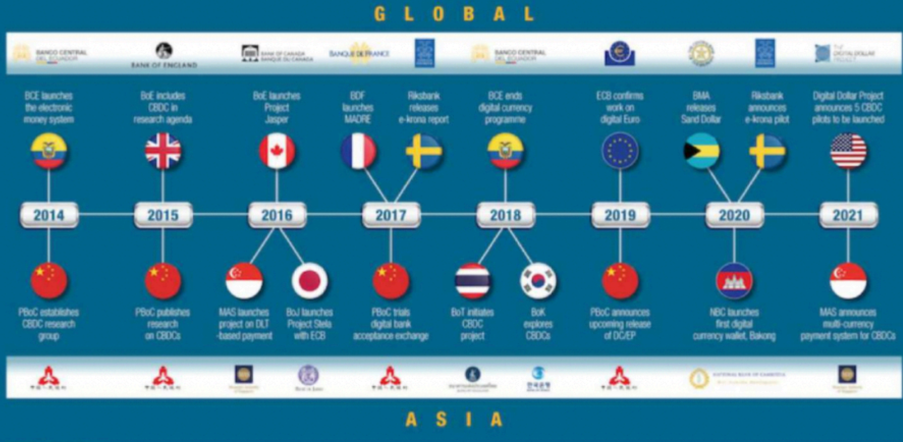
Fig 1.0 - Bahamas becomes the first country to officially launch a CBDC